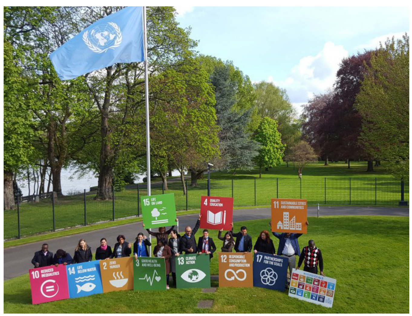
UNSSC Bonn Campus, April 2016.