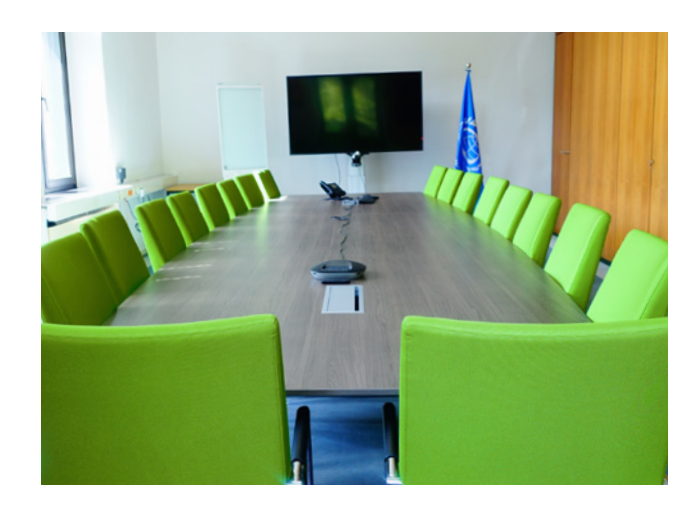
Sustainable Development Conference Room

Haus Carstanjen has witnessed historic processes in the pursuit of development, such as the administration of the German Marshall Plan. Located in the midst of an English garden, right on the banks of the river Rhine, the castle constitutes a perfect hub for learning and training on sustainable development. It is an ideal venue for leadership seminars, small retreats, and other learning events. Our facilities provide flexible and technologically advanced learning environments that are safe, healthy, comfortable, aesthetically pleasing, and accessible.