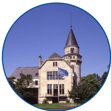
United Nations System Staff College

The Consensus Building Institute is a not-for-profit organization founded in 1993 by leading practitioners and theory builders in the fields of negotiation and dispute resolution and affiliated with Harvard and MIT. CBI has decades of experience building skills and competencies for negotiation and consensus building on sustainable development issues for UN and non-UN audiences.